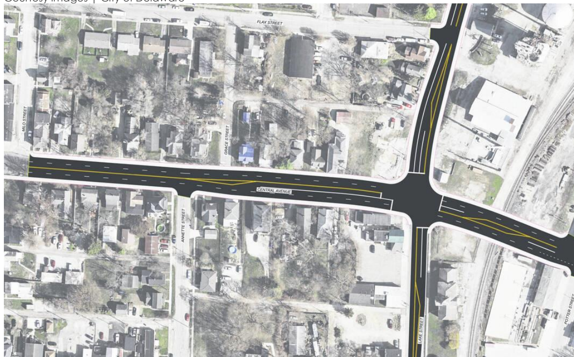
A rendering of the proposed improvements to the intersection at Lake Street (U.S. 42) and East Central Avenue (state Route 37) in Delaware.