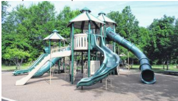
Pictured is playground equipment at Ro Park. Located at 6804 Snapdragon Way in Lewis Center, improvements were recently made to the park by Orange Township.